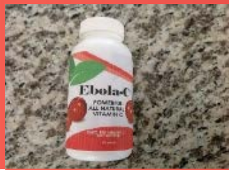
POWERFUL ALL NATURAL VITAMIN C *BEST VALUE* 120 count