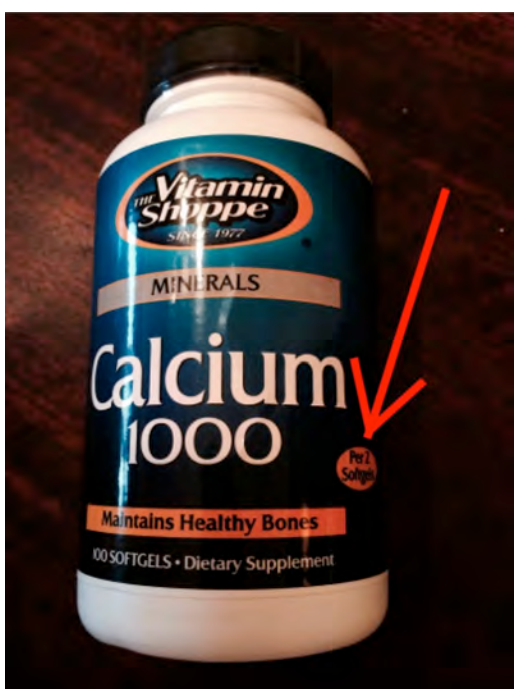
32. The table below provides shows some of the Accused VSI Products, and compares the represented quantity of active ingredient with the actual quantity per unit: