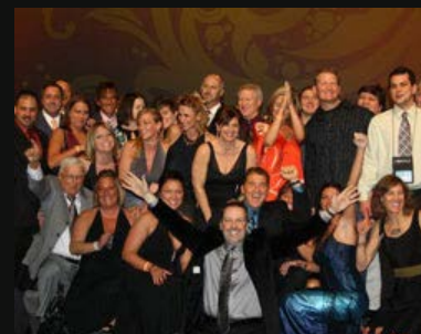
A proud team