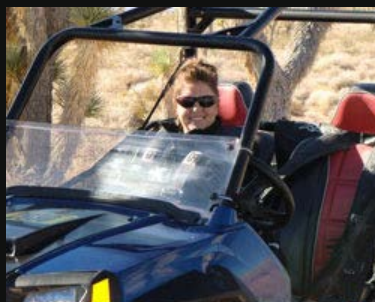
4 wheel Fun in the Nevada desert