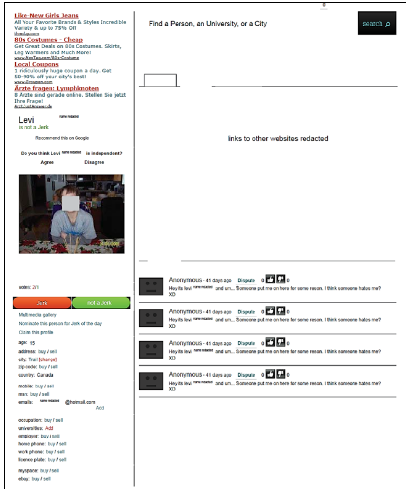
Figure 1 (Exhibit A) (photo and identifying information redacted by the FTC).

6. Jerk profiles contained a profile subject’s first and last name. Directly underneath the profile subject’s name were voting buttons that any user could click to vote whether the person was a “Jerk” or “not a Jerk.” Many profile subjects were identified as a “Jerk” or “not a Jerk.” The profiles also contained fields where any user could enter the profiled subject’s age, address, mobile phone number, email address, occupation, school, employer, home phone number, work phone number, license plate number, and Twitter, MySpace, LinkedIn, and eBay account information.