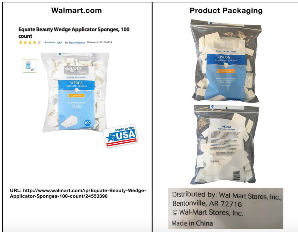
Example of the type of false Made in USA claims TINA.org found on Walmart.com

As a result, TINA.org filed a complaint with the FTC, requesting that the Commission take action. Id. Walmart made similar false assurances to the FTC and claimed it had removed all country-of-origin designations from its website. 5 Id. The company also touted a legal disclaimer—placed at the bottom of every product page on its website—that its products may not, in fact, be American-made, despite claims to the contrary, thereby attempting to shift the burden to consumers to verify origin claims directly with product manufacturers. Id. Notwithstanding the legal deficiencies of the disclaimer, the FTC took the company at its word and issued a closing letter on October 20, 2015. Walmart Closing Letter, Oct. 20, 2015, https://www.ftc.gov/system/files/documents/closing_letters/nid/151020walmartletter.pdf . Less than a year later, a follow-up investigation by TINA.org found that the retailer never came into