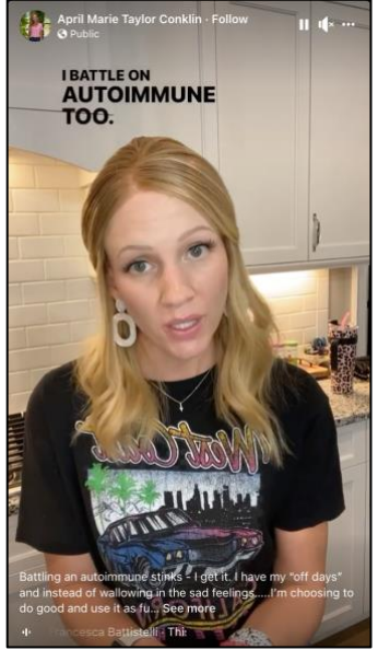
September 6, 2023 Facebook reel<sup>7</sup>

"Battling an autoimmune disease stinks - I get it. I have my 'off days' and instead of wallowing in the sad feelings....I'm choosing to do good and use it as fuel to make an even bigger impact, thanks for listening and helping me. ... I believe everything happens FOR ME, not to me and because of my autoimmune and nursing background~ both made me more open minded when my friend shared Juice Plus with me.....and when I saw the research behind this I was ALL IN!!!! Anything that is clinically proven to decrease inflammation and oxidative stress in the body is a MUST HAVE for all of us......less inflammation = less illness/disease all the way from the common cold to the big ugly C word and even autoimmunes. ...."