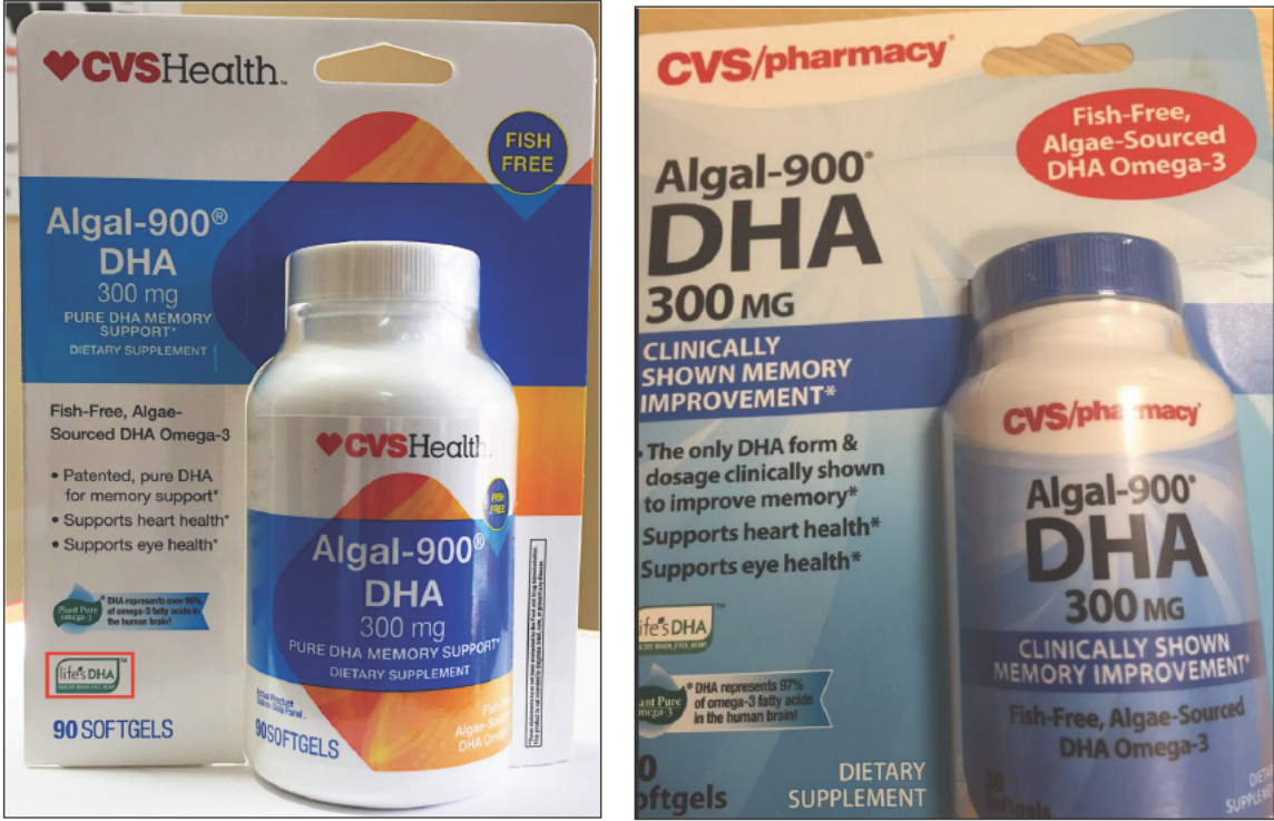
[CVS's Algal-900 DHA photographed by TINA.org on June 1, 2016.]

CVS Pharmacy is currently selling Algal-900 DHA under a label that states "Memory Support," implying the supplement can improve memory and/or prevent cognitive decline, in violation of the 2014 Order. Further, the product bore a label making the express claim "clinically shown to improve memory" up until December 2015.<sup>3</sup>