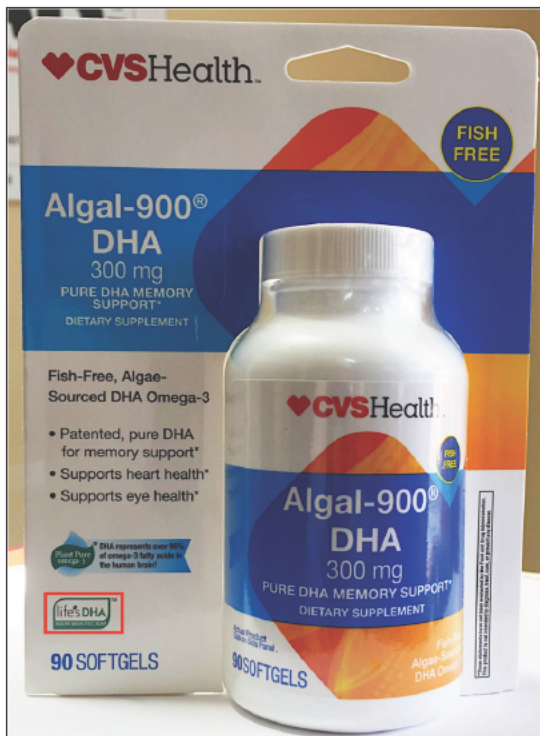
[CVS’s Algal-900 DHA on June 1, 2016.]

CVS Pharmacy is currently selling Algal-900 DHA under a label that states “Memory Support,” implying the supplement can improve memory and/or prevent cognitive decline, in violation of the 2014 Order. Further, the product bore a label making the express claim “clinically shown to improve memory” up until December 2015. 3