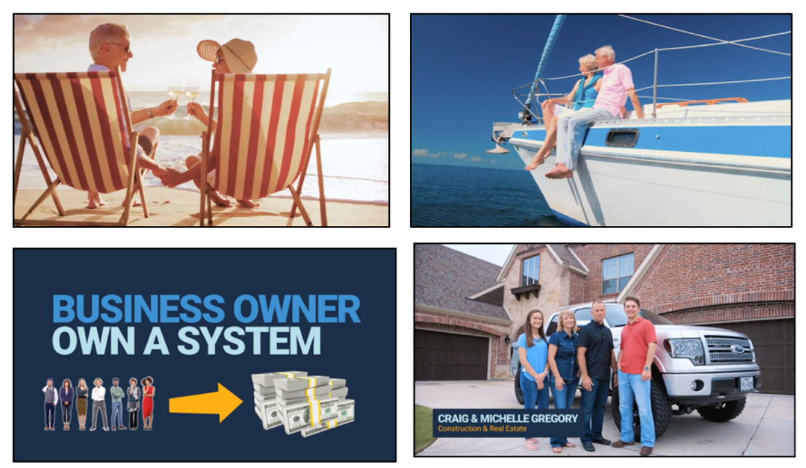
Screen shots from the Road to Financial Freedom 2019 video

The above excerpts and images are typical of the more than 250 examples of Team National marketing materials that make exaggerated and deceptive income claims.<sup>7</sup> Put simply, the internet is littered with these types of income claims. And though some of the company's marketing materials include language to indicate that the results depicted are not typical,<sup>8</sup> Team National's disclaimers are legally insufficient as none of them clearly or conspicuously disclose what typical participants earn (i.e., nothing) and none of them are placed in a conspicuous location.<sup>9</sup>